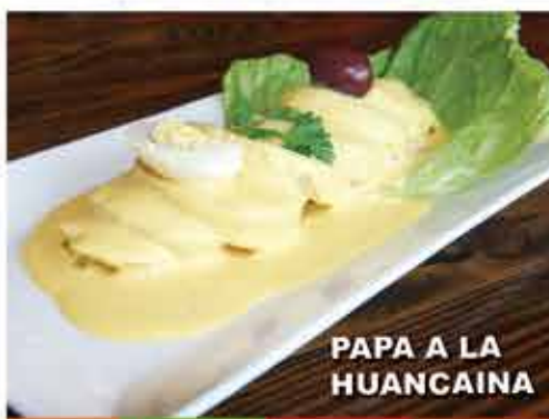
PAPA A LA HUANCAINA

Notice: May be cooked to order. Consuming raw or under cooked meats, poultry seafood, shellfish, or eggs may increase your risk of food borne illness, especially if you have certain medical conditions